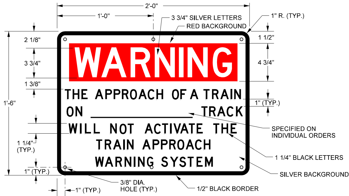
WARNING SIGN ORDER NON-STOCK & REF. THIS STD DWG NO.